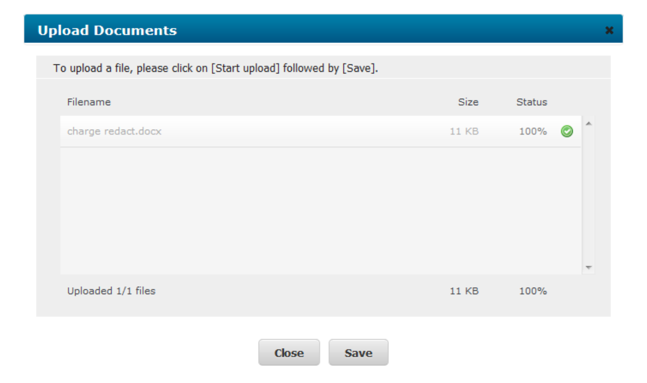
Step 3: The redacted charge sheet will be uploaded successfully in the ICMS as shown below.